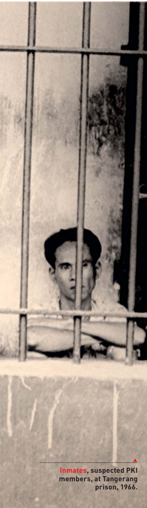
Inmates , suspected PKI members, at Tangerang prison, 1966.

Following the 1965 bloody events, Kopkamtib (Command for the Restoration of Security and Order) mounted Operations Kalong (Bat) and Trisula (Trident) to capture, detain and interrogate people accused of being PKI members around the country. Without due process of law, these people were thrown into concentration camps. Besides remote Buru Island in eastern Indonesia where political detainees were exiled, others were imprisoned in Gunung Sahari II (Jakarta), Pelantungan (Central Java), Jalan Gandi (Medan), Pulau Kemaro (Palembang) and Mocongloe (South Sulawesi) jails. These were Indonesia's version of Guantanamo. In those hell-holes, they suffered varying degrees of mental and physical torture.