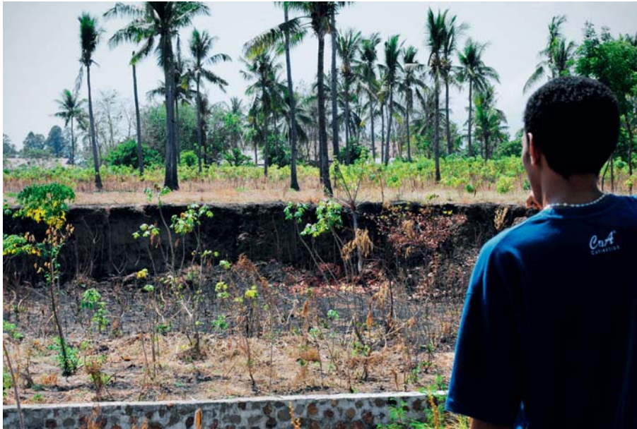
◀ Garam hamlet, the massacre location.