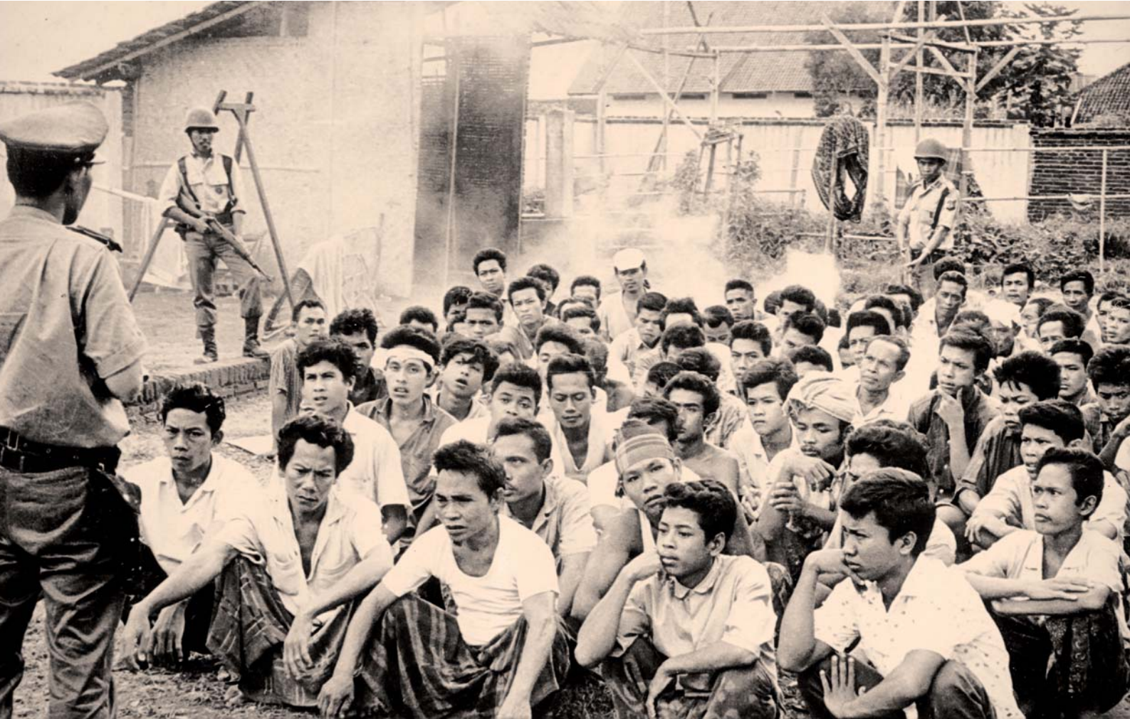
▲ PKI members and sympathizers rounded up in Bali.