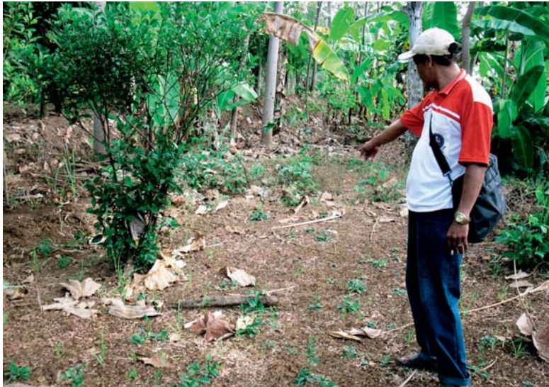
◀ Tjoekir Sugar Factory, biggest PKI base in East Java.