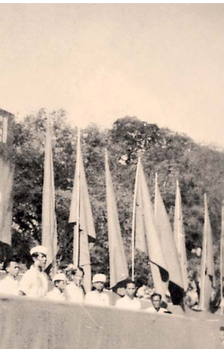
◀ Labor Day celebration by PKI members in East Java.

fate. Even though some were physically tall and large, they did not try to run away or resist. After intimidating them once, their mental condition usually ebbed.