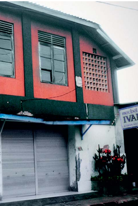
◀ Baluk Rening Beach, Baluk village, Jembrana, Bali, and Toko Wong.

military also issued lists of people suspected to be PKI members, complete with documents on their 'planned rebellions.'